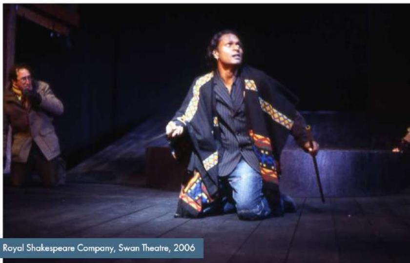
Royal Shakespeare Company, Swan Theatre, 2006

Rejected by Hamlet, Ophelia is now desolate at the loss of her father. She goes mad and drowns.