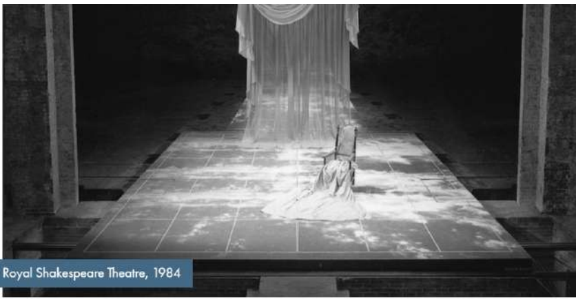
Royal Shakespeare Theatre, 1984